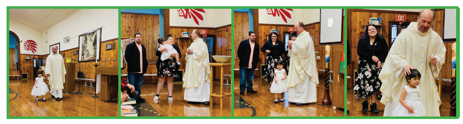
The last baptism in the gym Church.