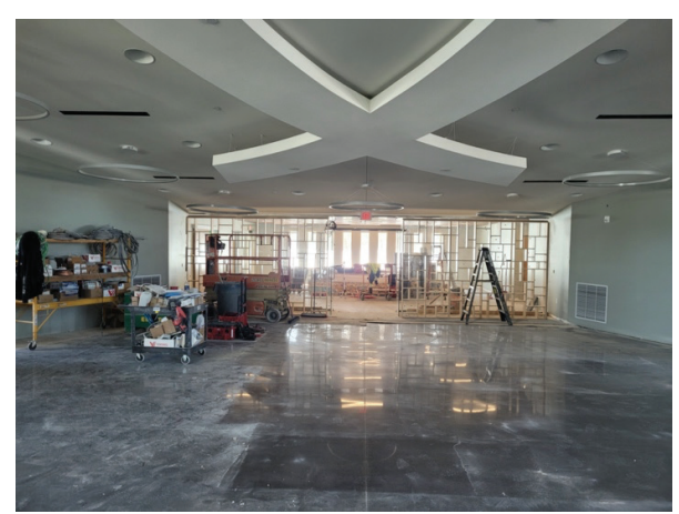
View from altar. The design includes an "icthys" on the ceiling.

We are nearly finished with the New Church project at St. Mary's Mission. Because of the resounding response from all of you generous donors , we are seeing the finish line. The amount of money that we have raised over the last three years is simply breathtaking . We have raised over 2 million dollars with money still coming in. Thank you, God! Thank you, everyone!